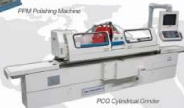
PCG Cylindrical Grinder

Jinan Power is dedicated to the design and manufacture of the full-line machineries for rubber roller processing.