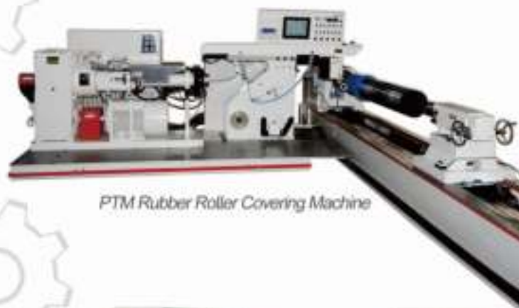
PTM Rubber Roller Covering Machine