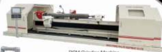
PSM Grinding Machine