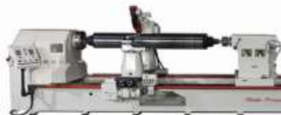
PCM Multi-Purpose Stripping Machine