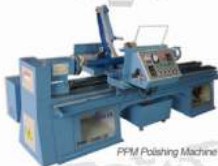
PFM Polishing Machine